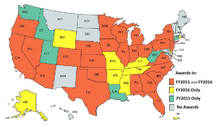
Body-Worn Camera Grant Applications 492 Submitted, 179 Awarded